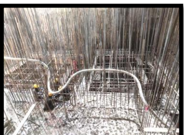
Dewatering Pump Conc.