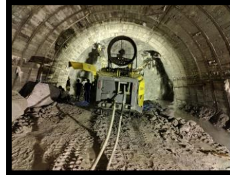
HRT Face-3 heading form face 2 side