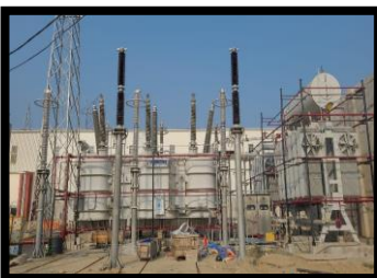
Substation work at Dhalkebar