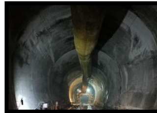
HRT Face-4 Overt Lining