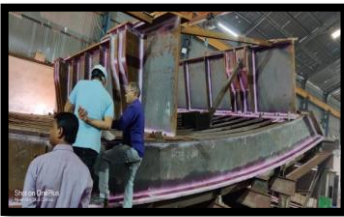
Radial Gate Inspection at Kota