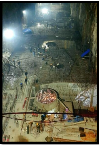
Powerhouse Machine Hall