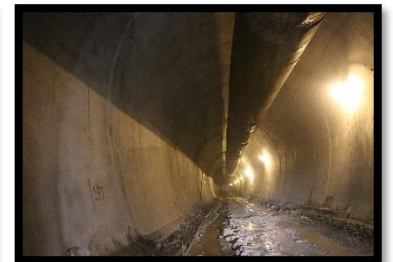
Face-7 Overt lining