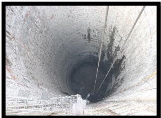
SS Exc. From Top