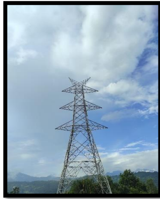
Tower Erection Work