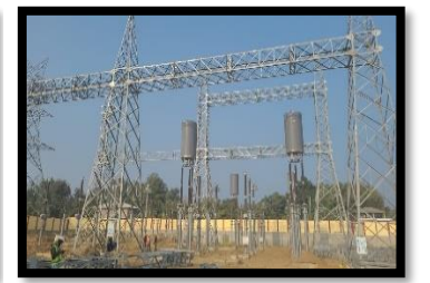
Substation work at Dhalkebar