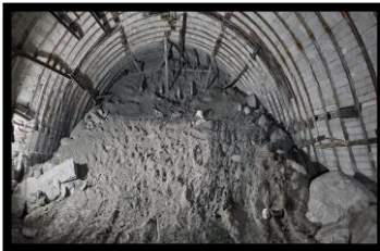
HRT Face-4 Heading