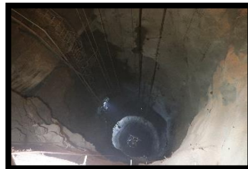
Vertical PS 1