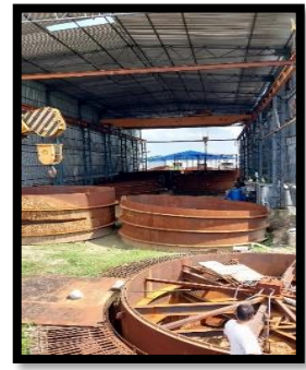
HM works at workshop