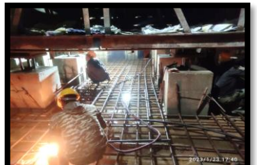
2 nd stage conc. of Unit#2