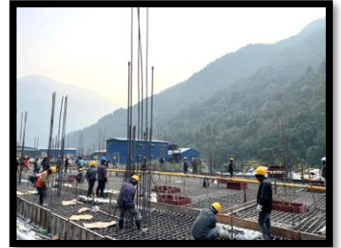
GIS Raft A Portion