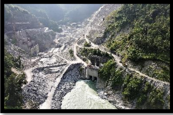
Dam Site overview