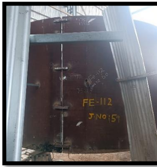
HM works at workshop