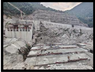
Left Bank Dam Stripping