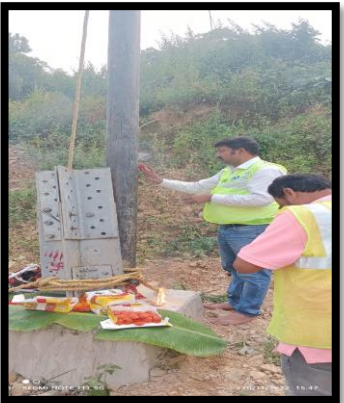
Tower Erection Work