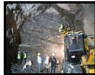
HRT Face-7 Heading