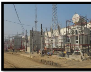
Substation work at Dhalkebar