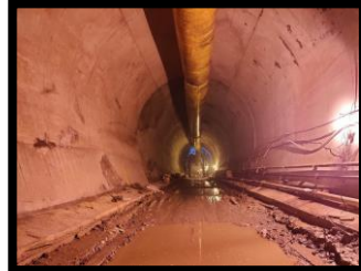
HRT Face 2 Overt Lining