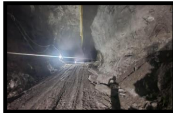
HRT Face-4 Benching