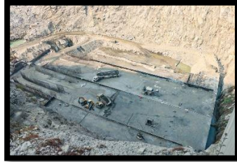
Dam Pit concreting