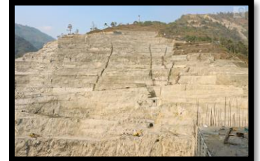
Right Bank Dam Stripping