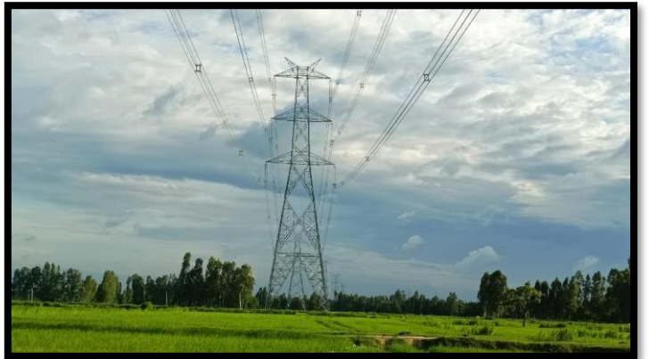
Tower Stringing Work