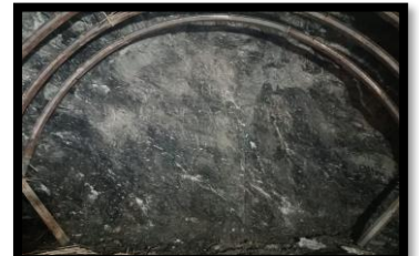
HRT Face-5 Heading