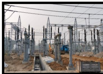
Substation work at Dhalkebar