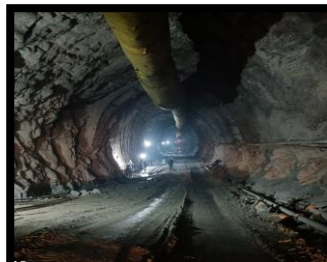
HRT Face-6 Benching