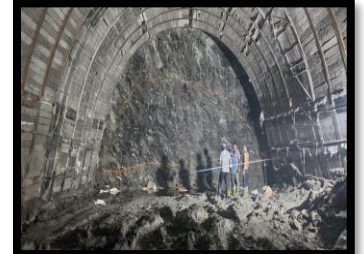
HRT Face-3 Heading