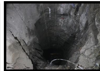
Vertical PS- 2