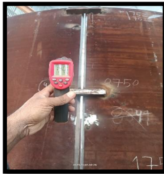
HM works at workshop