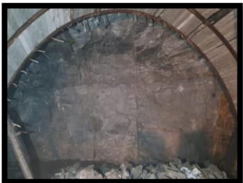
HRT Face-6 Heading